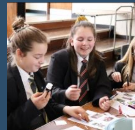
Fairtrade Workshop Page 11