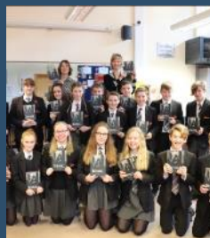
SCA News Page 7