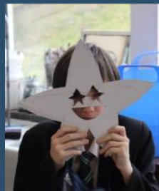
Arts News Page 8/9