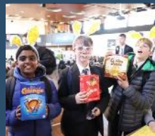
Easter Raffle Pages 2