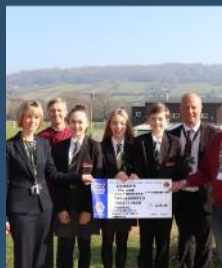
Lions Club Page 6