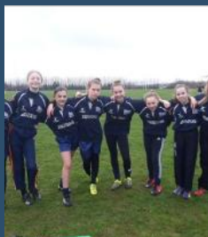
Sporting Success Pages 4/5