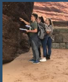
Field Work Page 7