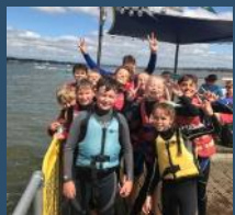
Activities Week Page 2