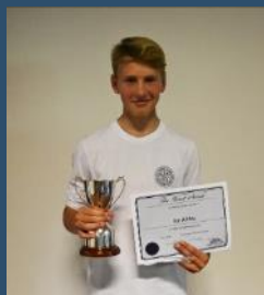
Year 9 Awards Page 6