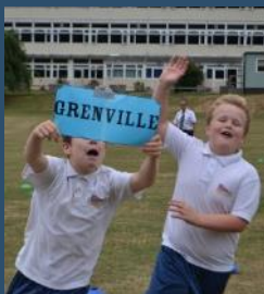
Sports Day Page 3