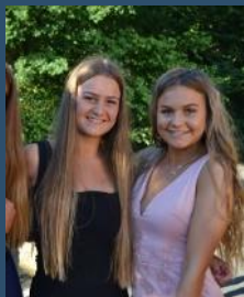
Summer Ball Page 5