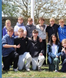
Ten Tors Page 4