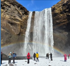
Iceland Trip Page 2

Summer Term: Edition 5 Friday 22nd May 2026