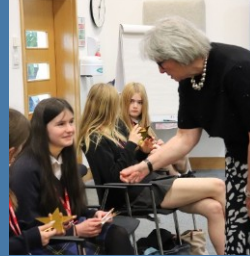
Empowering Girls Page 5