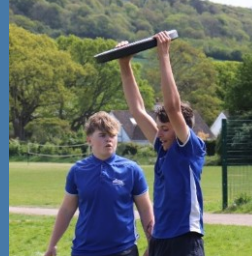
PT Session Page 6