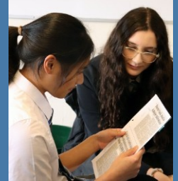
Media Studies Page 7