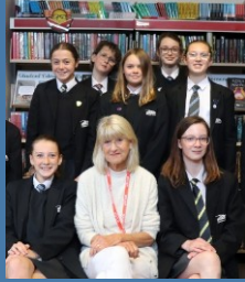
Author Visit Page 3