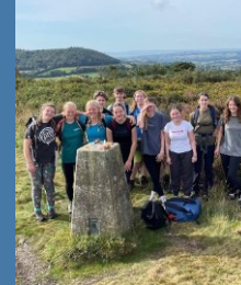
Ten Tors Page 6