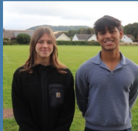
Student Leadership Page 4