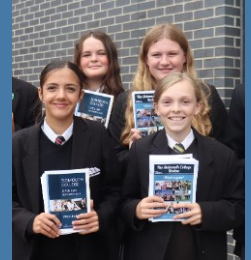
Open Days Page 7