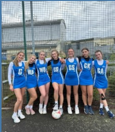
Sports News Page 3