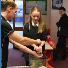
Careers Page 2

Autumn Term: Edition 1 Friday 25th October 2024