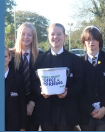
Bake Sale Page 5