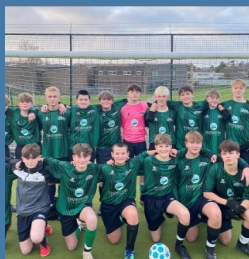
Sports News Page 3