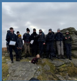
Ten Tors Page 4