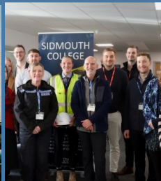
Careers Page 6