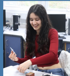
Sixth Form Page 7