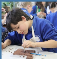
Art Workshop Page 2

Spring Term: Edition 3 Friday 14th February 2025