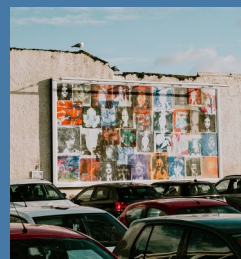
The Codex Project Page 5