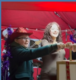
Christmas Lights Page 3