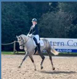
Sports News Page 5