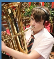
Christmas Page 2

Autumn Term: Edition 2 Friday 19th December 2025