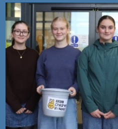
Fundraising Page 8