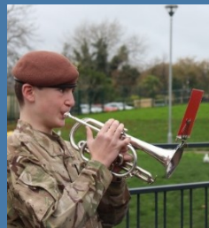
Remembrance Page 7