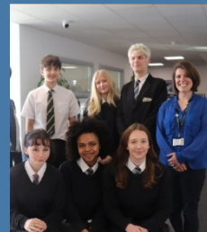
Media Studies Page 9