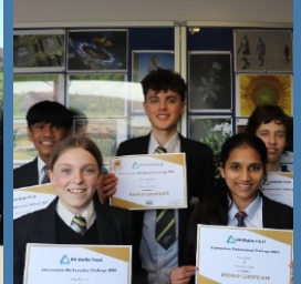
Maths Challenge Page 8