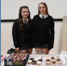
Bake Sales Page 2

Spring Term: Edition 4 Friday 2nd April 2026