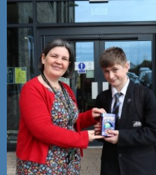
Attendance Page 6