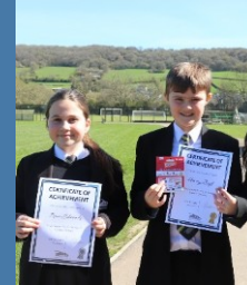
Praise Page 7