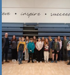
MP Visit Page 5