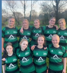
Sports News Page 3