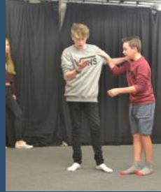
Auditions Page 6