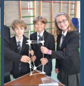
Science Week Page 8