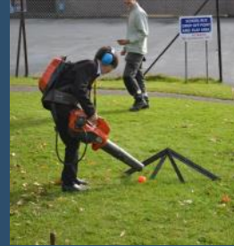
Careers Page 7