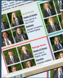
Heads of House Page 3