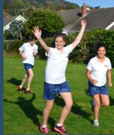
Sport Achievement Page 4