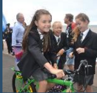
Tour of Britain Page 2