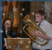
Carol Service Page 2