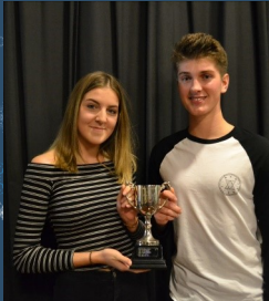
Awards Evening Page 5