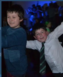
Christmas Party Page 3