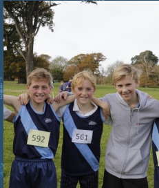
Sports Achievement Page 4