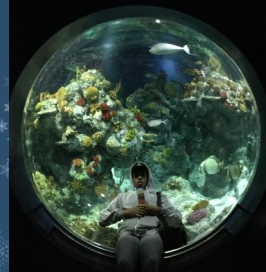
Trips Page 8 & 9