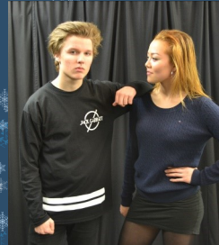
Youth Theatre Page 6