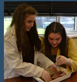
Sixth Form Page 9