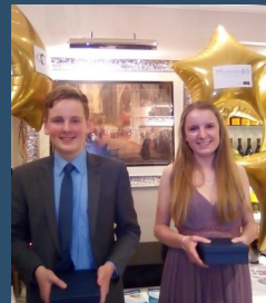
Awards Page 8