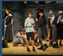
Oliver! Page 2/3