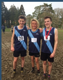
Cross Country Page 5