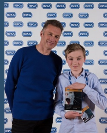
Competitions Page 6