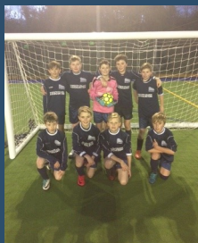
Sport Achievement Page 4