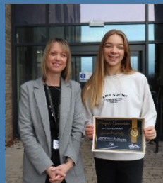
Commendations Page 4