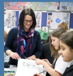
Primary Visit Page 7