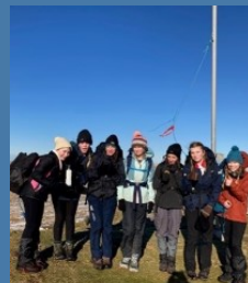
Ten Tors Page 6