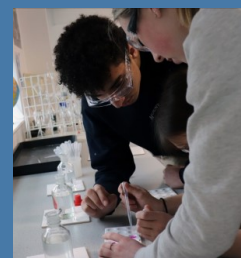
Sixth Form Page 8