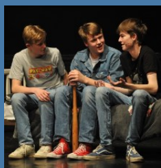
Back to the 80's Page 2 & 3

Spring Term: Edition 3 Friday 10th February 2023