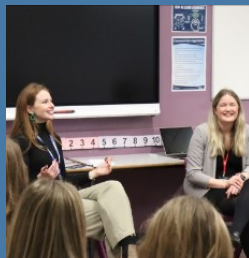
No Label, No Limit Page 5