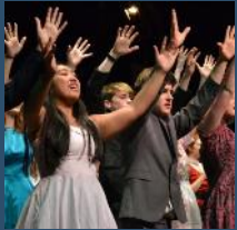
Showtime! Page 2/3