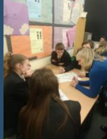
Impact Day Page 6