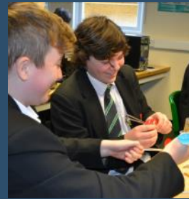
Met Office Workshop Page 7