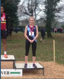
Sport Achievement Page 4