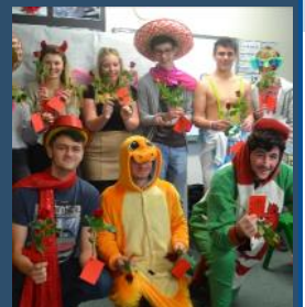
Valentines Day Roses Page 8