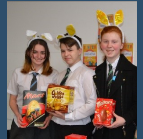
Easter Page 9