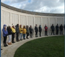
Holland Trip Page 2