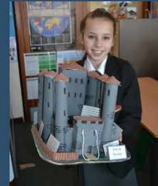
Castles Page 8