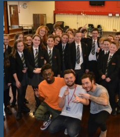
Roman Road Page 6