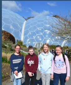
Eden Project Page 5