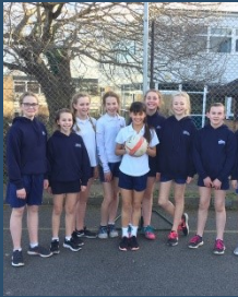
Sport Achievement Page 3/4