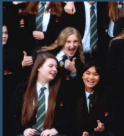
Goodbyes Page 5