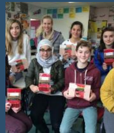
Competitions Page 7