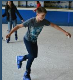
Trips Page 6