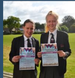
Fundraising Page 8