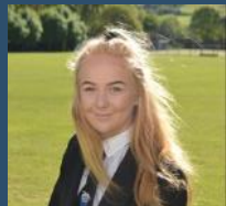
Heads of House Page 2