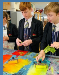
Printing Page 7