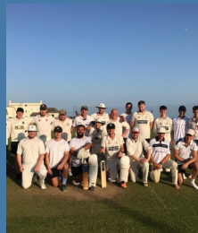
Fundraising Page 5