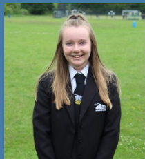
Heads of House Page 2

Summer Term: Edition 6 Thursday 22nd July 2021