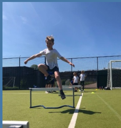
Sports News Page 4