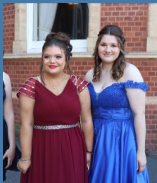
Summer Ball Page 3